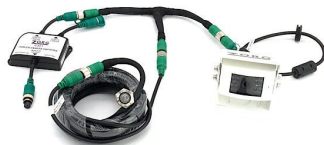
4313 Kit shown with 2001 IR Camera - Not Included in 4313